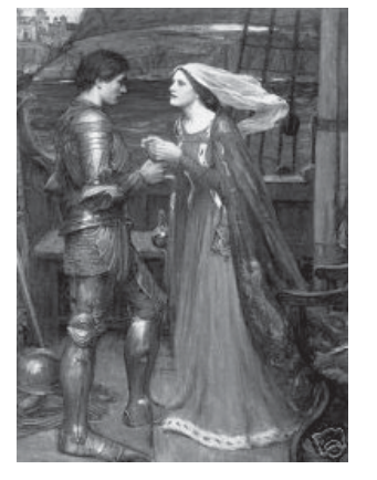
makes it worth a look.

Tristan and Isolde is the legendary tale of a pair of medieval